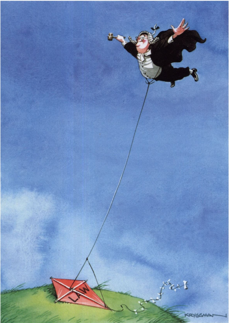
The above illustration is the work of Sturt Krygsman and was first published in The Australian newspaper, October 15, 2003. It is reproduced by permission of the artist and the original is now in the possession of the author.